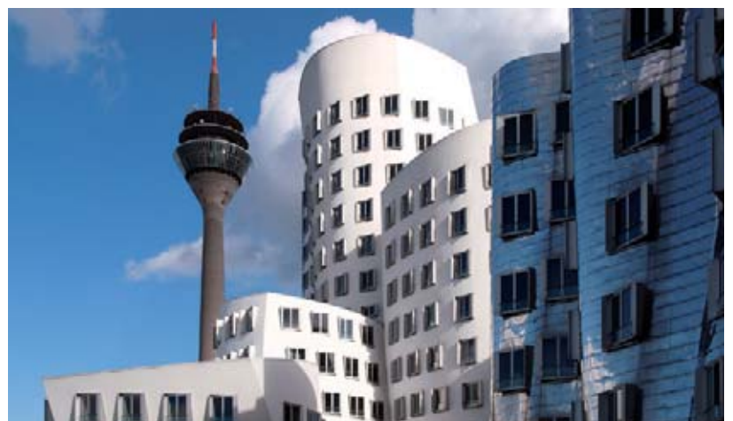
Potential operation site: Frank O. Gehry apartment complex in Düsseldorf.