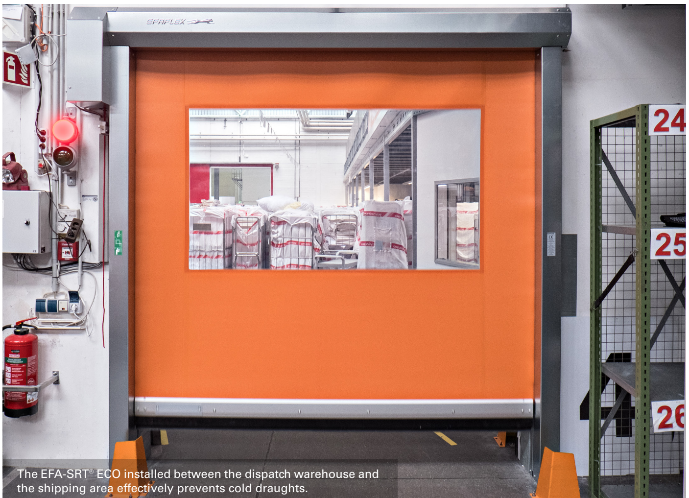
The EFA-SRT® ECO installed between the dispatch warehouse and the shipping area effectively prevents cold draughts.

number of work cycles. Around 1,100 laundry containers roll from the delivery warehouse to the dispatch department every day. Nevertheless, it now stays warm and the employees in the delivery warehouse are very happy with it. 'I have only good things to say about EFAFLEX,' says the production manager. 'Everything worked very well, from the consultation with the sales representative to the planning and installation. The price is right, and our request for a traffic light system at the door to prevent accidents was implemented immediately.' In addition, EFAFLEX is right on the doorstep, so customer service for maintenance is not far away.